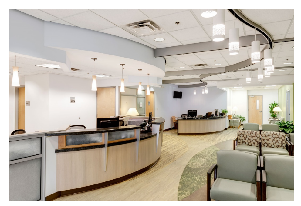
Sentara Virginia Beach Ceneral – Main Breast Center Lobby.

The mission of the American Academy of Healthcare Interior Designers (AAHID) is the certification of interior designers qualified by education, examination, training and experience to provide interior design services to the healthcare industry.