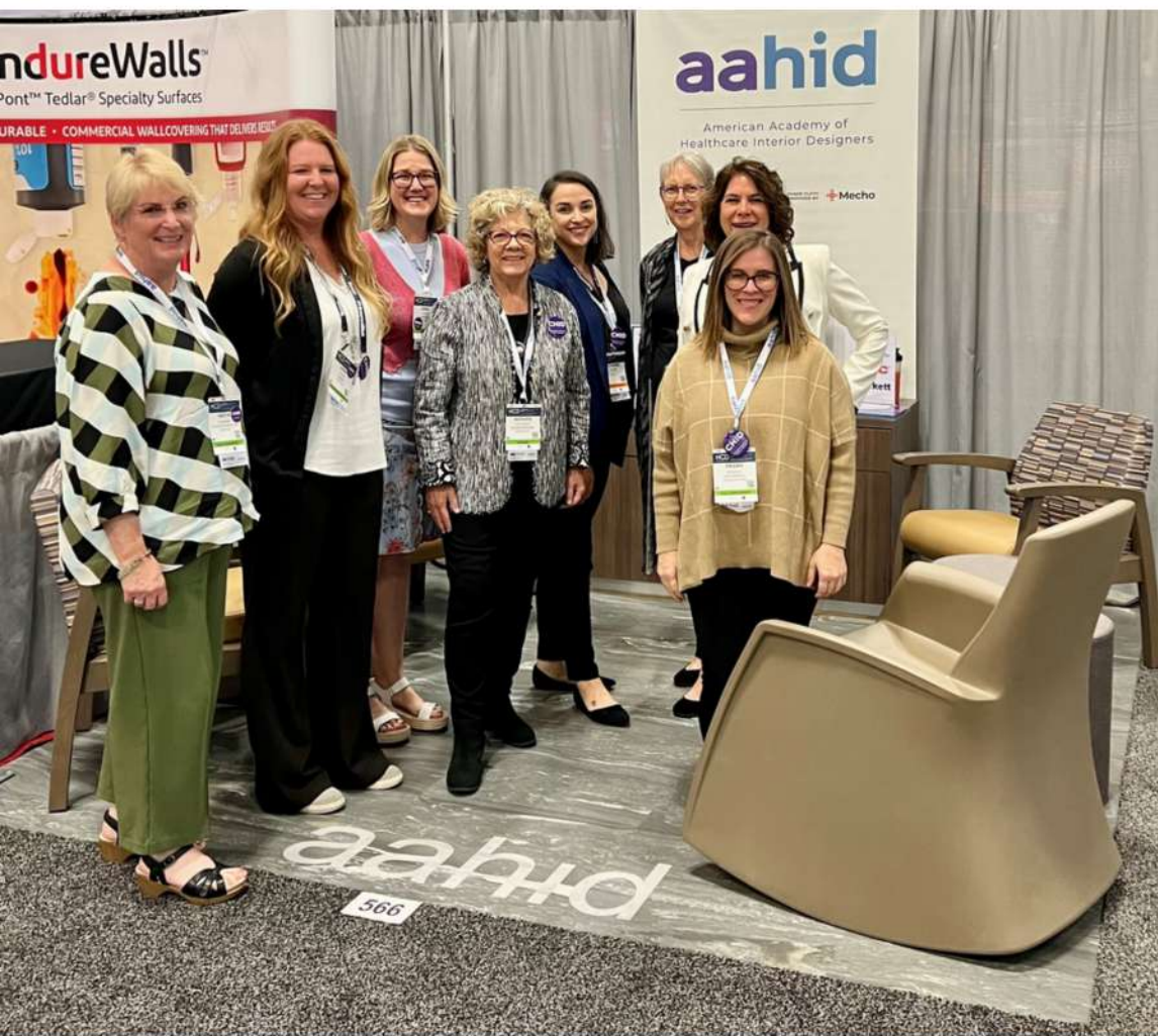
2022 HCD AAHID Booth and Board of Directors