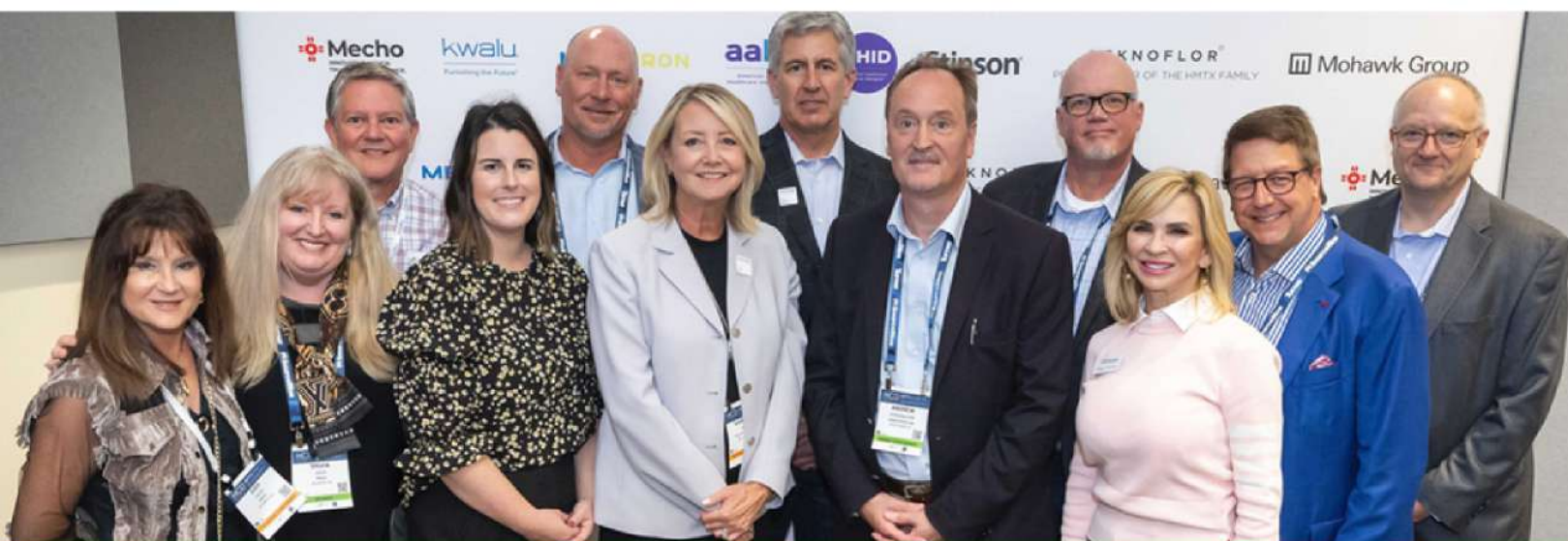
HCD 2022, Annual Reception Partners