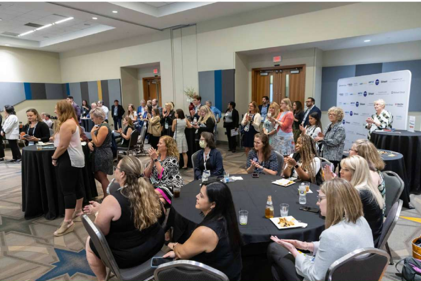
Group photo from HCD 2022 Reception

NeoCon has served as the world's leading platform and most important conference and trade show event of the year for the commercial interior design industry since 1969.