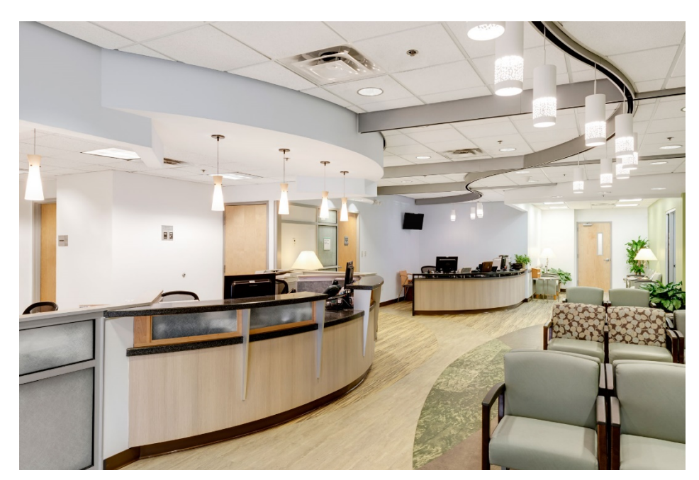
Sentara Virginia Beach General – Main Breast Center Lobby.

The mission of the American Academy of Healthcare Interior Designers (AAHID) is the certification of interior designers qualified by education, examination, training and experience to provide interior design services to the healthcare industry.